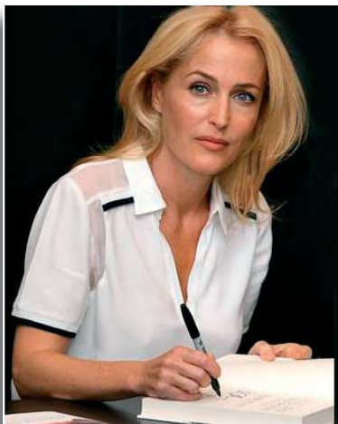
Gillian Anderson will present the £5,000 cheque to the winners